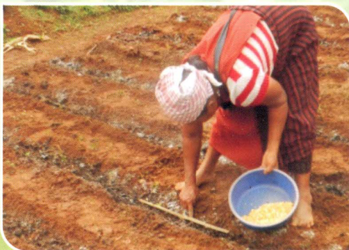
Ka rukom bet symbai ha ki lain

Ka jingdonkam symbai ka shong katkum ka jingheh jong u jait symbai ne ka jingiar haba thung. Dei ban thung katkum ka jingdonkam symbai ban ioh ia ka jingdon ne jingbun jingthung kaba biang. Lah ban ioh kheit kham bun lada lah ban pynbiang ia ka jingdon tynrai kaba 65,000 haduh 75,000 tylli ha man ka shi hektar ka jaka, kaba donkam kumba 20-25 kilo ei ei u symbai ha shi hektar ka jaka. Ka jingiar jingkhah kaba tikna katkum ka jingkyanjang ka jaka ka long kumne harum.