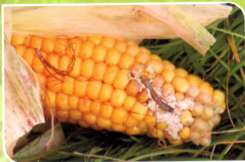
U niangsam thliw ha u riewhadem

Ñiang sam thliw ha u riewhadem (Cob borer): Une u khñiang u ksam bad pynsnew ãa u riewhadem. Ban iada na une u jait khñiang dei ban synreit daka dawai Endosulphan 0.07% lane da ka Monocrotophos 0.05% hadien kumba 80-90 sngi ba la dep thung.