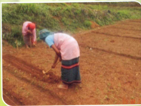
Ka jingshna ia ki nur rit ha ka jaka thung

Ka jingshna ia ki nur rit ha ka jaka thung Ka long kaba donkam ban lur kumba ar lane lai sien khnang ban ioh ia ka khyndew kaba ni bad ban pynduna na ki niut ki niier. Ka long kaba donkam ruh ban bet ne buh ia u symbai ha ki bun rit ban lait naka jingpyut lada ka um ka ioh ban lang bad ban ioh ruh ia ka jingsngem kaba biang. Lada thung haka jaka kaba long madan dei ban ai