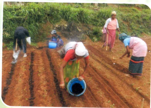
Ka rukom pynkhreh ia ki nur ban ai sboh bad shun

Nalor ka jingmih kaba biang ka long kaba donkam ban pynbha ia ka khyndew da jingpynbiang sboh khnang ba kan lah ba kyrshania ka lawei. Pyndonkam ia ka sboh jingri kumba 5-10 t/ha bad ber iaka kumba shi taiew lane ar taiew shuwa ban thung. Ban ioh ia u riwhadem u ba seisoh, ka jingpynbiang ia ka sboh dawai katkum ka jingdonkam hadien ba la test ia ka khyndew ka dei