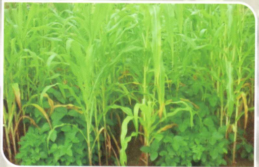
Riewhadem ba thung lang bad rymbai ktung ha ki laiű

Pyntreikam ĩa kane ka rukom rep ban kham iohnong da kaba thung lang u riewhadem kumne ba la batai, riewhadem + mator, riewhadem + rymbai ktung (2:2), riewhadem + dai űong (1:1), riewhadem + shana budam (2:2) bad riewhadem + rymbai ja. Ka jingreplang ĩa u riewhadem lem bad u shana badam la shem ba ka long kaba pyniohnong shibun haba ĩanujor bad kiwei ki jingthung ne haba thung la ka jong.