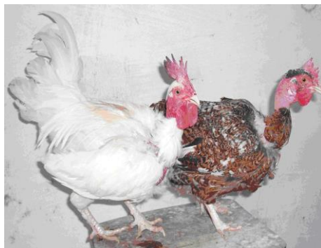
Fig. Naked Neck fowl