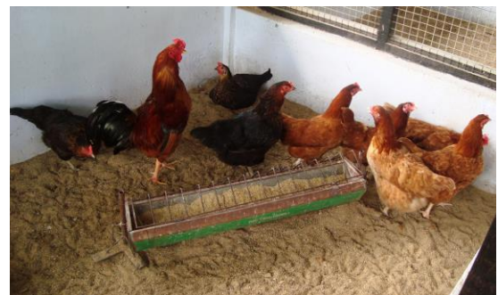
Fig. Vanaraja birds under deep-litter system