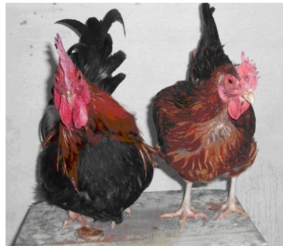
Fig. Normal feathered fowl