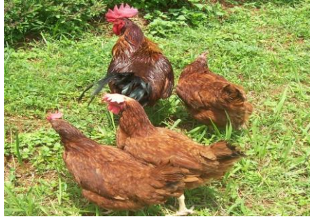
Fig. Gramapriya birds under free-range system