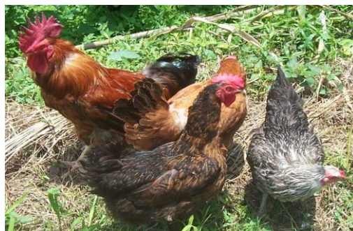
Fig. Vanaraja birds under free-range system