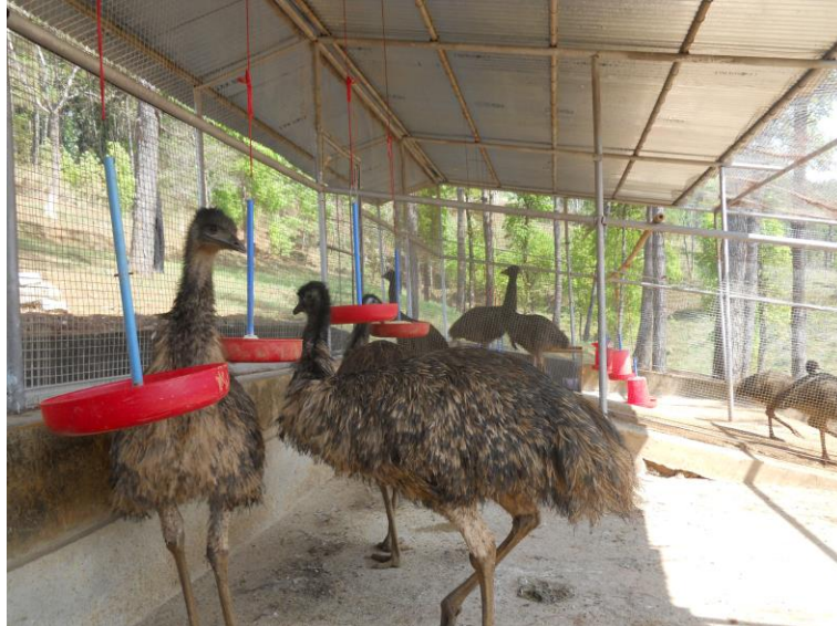
Fig. Emu birds under intensive system

skin adoptable to hardy and dry soil. Body is covered with feathers useful to extreme type of hot and cold climatic conditions. Bird starts laying eggs by two years of age with average egg weight 550g. Egg shell is green and shape is like torpedo or ovoid.