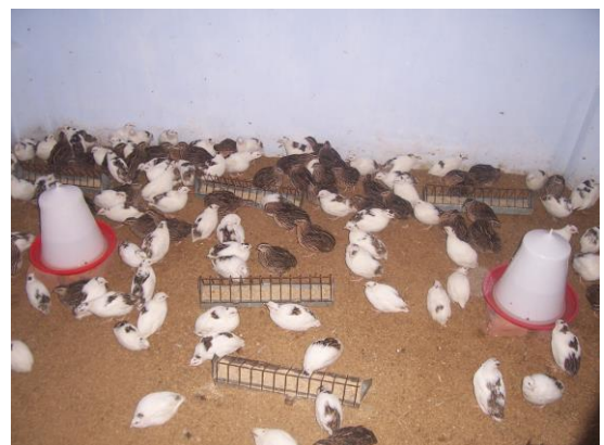
Fig. Japanese quail under deep-litter system