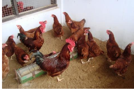
Fig. Gramapriya birds under deep-litter system