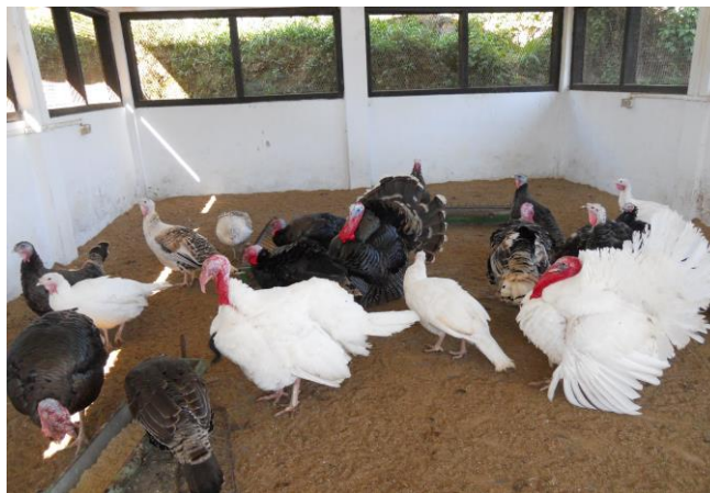
Fig. A flock of Turkey under deep-litter system

Turkey ( Meleagris Gallopavo ) is a large gallinaceous bird of the family Meleagridae . Commercial turkey farming is still at the stage of infancy and need to be popularized among farmers to provide diversified food and employment especially in India. Rearing turkeys can be an excellent family or youth project. They are quite suitable for upliftment of small and marginal farmers as the birds can be easily reared in free range or semi-intensive system with minimal investment for housing, equipment and management. They attain sexual maturity at the age of 200 days. Lay about 100 nos. of egg annually. Average egg weight 70g. Body weight at the age of marketing age ranges from 4.0 to 5.0 Kg.